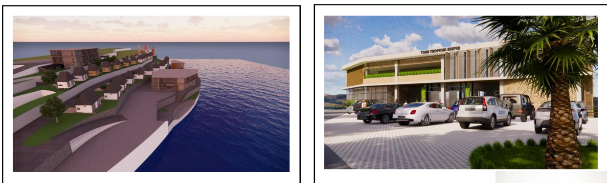
Figure 1. The Design

The results are in the form of images with presentations that follow the theme and are also based on data obtained from literature studies For example, it can be seen in Figure 3.3 below.